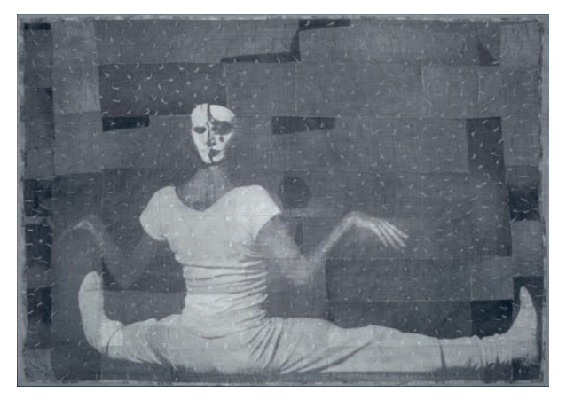
DAVID NOONAN Mask 2015 silkscreen on dyed linen collage, steel tray frame 214 x 304 cm Collection of the Art Gallery of Ballarat

* commissioned by the Australian Chamber Orchestra